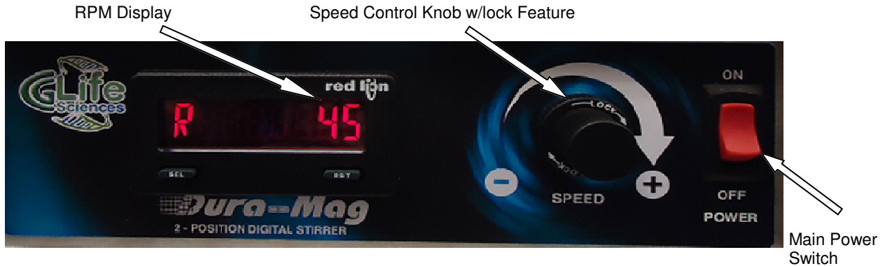
Figure 2—Front Panel

To operate, turn the main power switch to the “ON” position. Turn the speed control knob to set the desired rpm value. The units are designed to operate within a range of 25-400 rpm. Adjust the speed by turning the speed control knob, CW to increase speed, CCW to decrease it. The unit will ramp up (or down) to your selected speed. Turn the “LOCK” ring clockwise about an eighth of a turn to prevent any inadvertent changes to the set speed. Turn the “LOCK” ring counterclockwise to unlock the speed control knob.