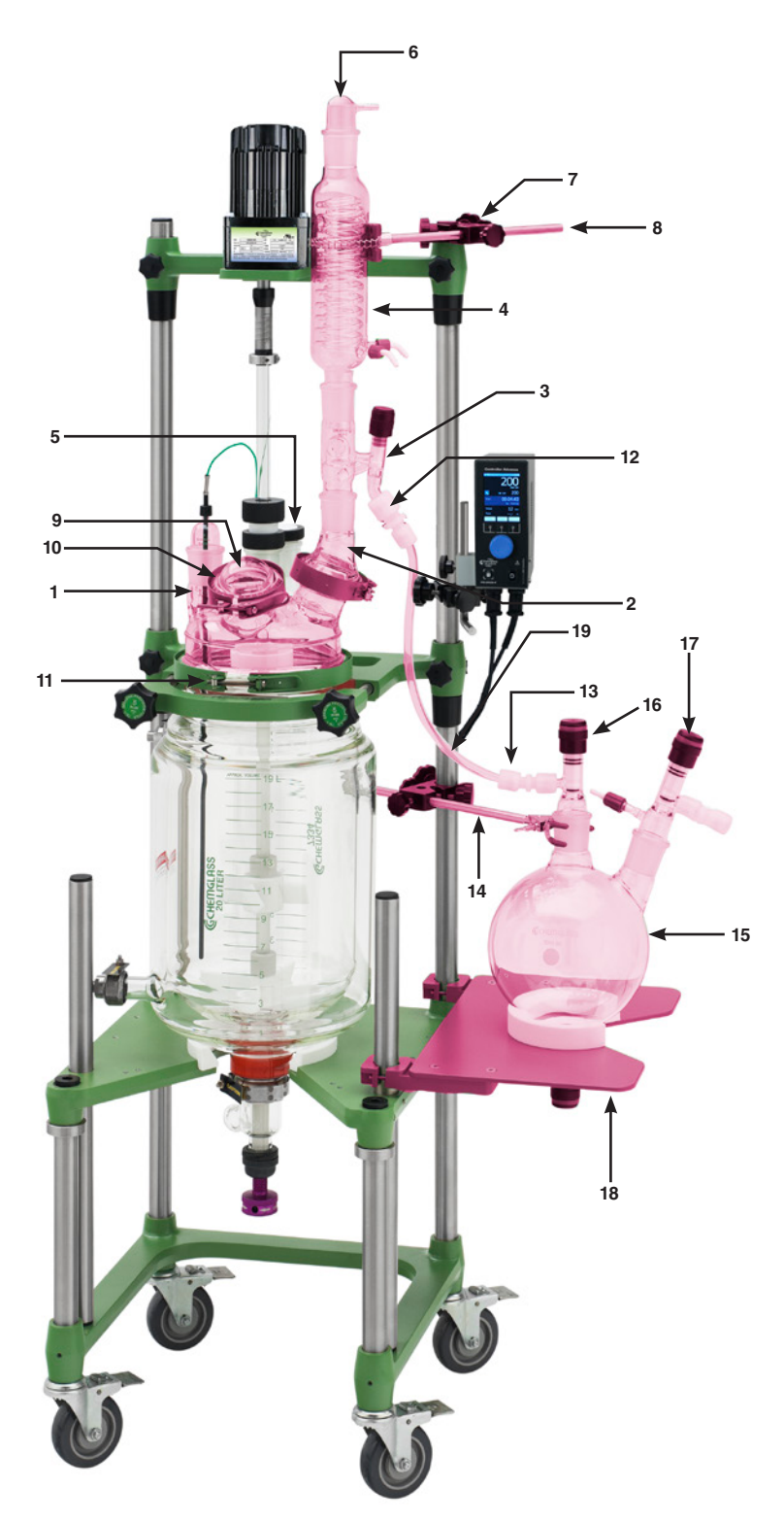
Highlighted Items are Included in Kit