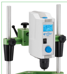
6a Digital Overhead Stirrer, 115v

Approx. Stand Dimensions: 15.25 W x 17.25 D x 40”H