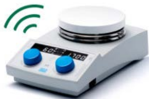
CG-1997-W; AREX-6 Connect PRO The First Cloud Enabled Hot Plate Stirrer