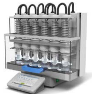
CG-1377; SER 158 Series Automatic Solvent Extractor