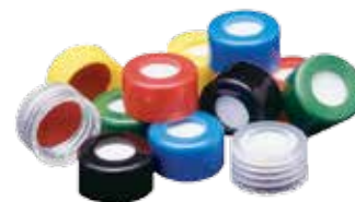
Replacement Caps for 9mm Threaded 12 x 32mm Vials