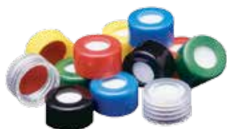
Replacement Caps for 9mm Threaded 12 x 32mm Vials