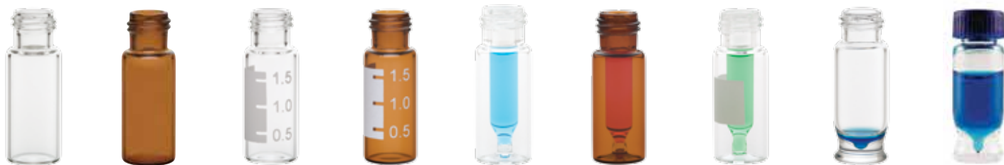
CV-1150-1232 CV-1151-1232 CV-1152-1232 CV-1153-1232 CV-1019-1232 CV-1020-1232 CV-1021-1232 CV-1102-1232 CV-5192-1232