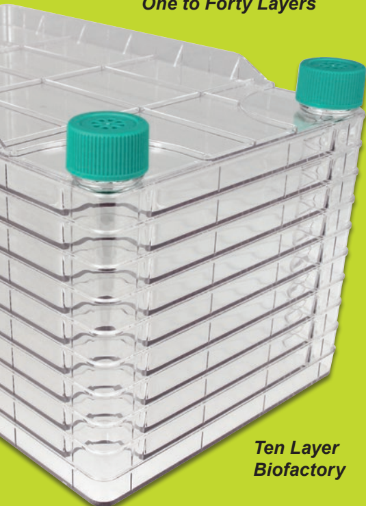
Ten Layer Biofactory

Available in Five Configurations from One to Forty Layers