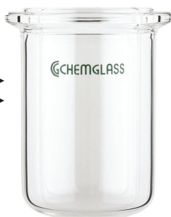
CG-MR-100V1 ▶ CG-MR-400V1 ▶