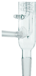
CG-152 Clamp installed on tubing/hose barb on glass condenser