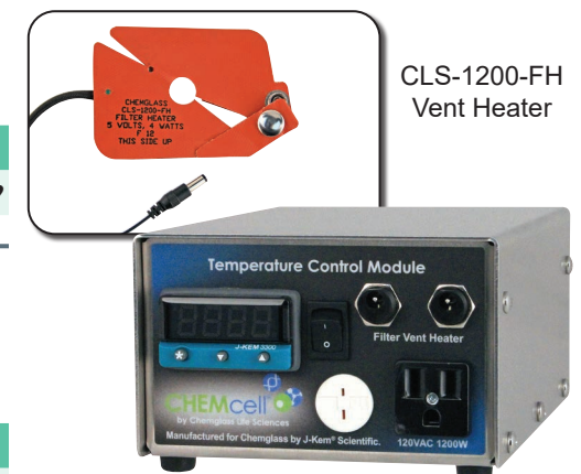
CLS-1200-2CH Temperature Controller