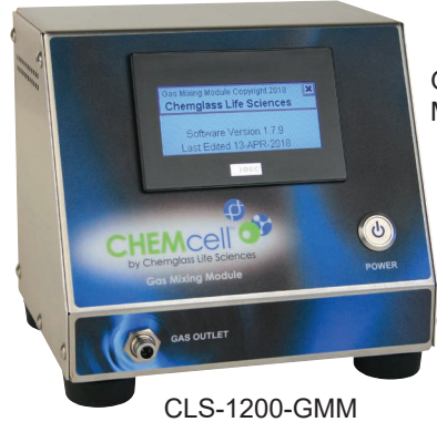
Gas Mixing Module