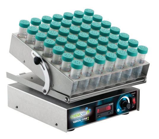
CLS-4285-R1 Bioreaction / Centrifuge Tubes and Shaker Base not included.

Note: Flasks and trays are not supplied with base and must be purchased separately.