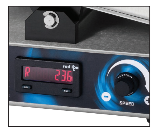
Digital Display and Locking Speed Control Knob