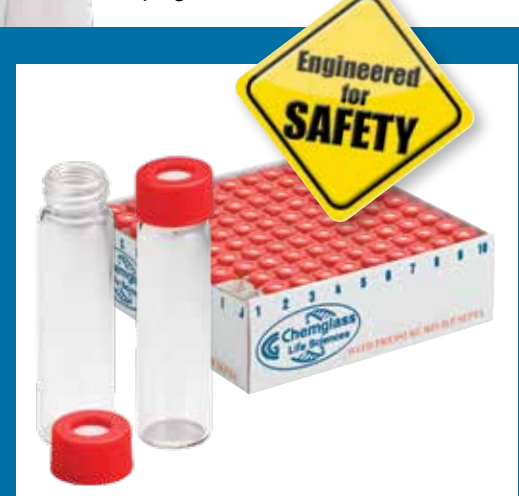
CG-4912 Pressure Relief