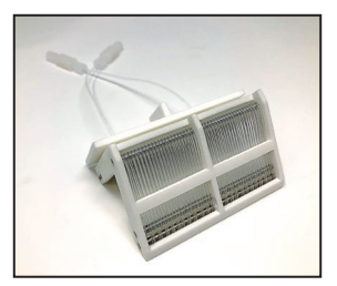
Flow Reactor CG-8003-31