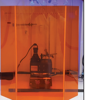
Amber Hood Screen CG-8003-43

† Reusable Glass/Plastics CG-24018IHpdf0124